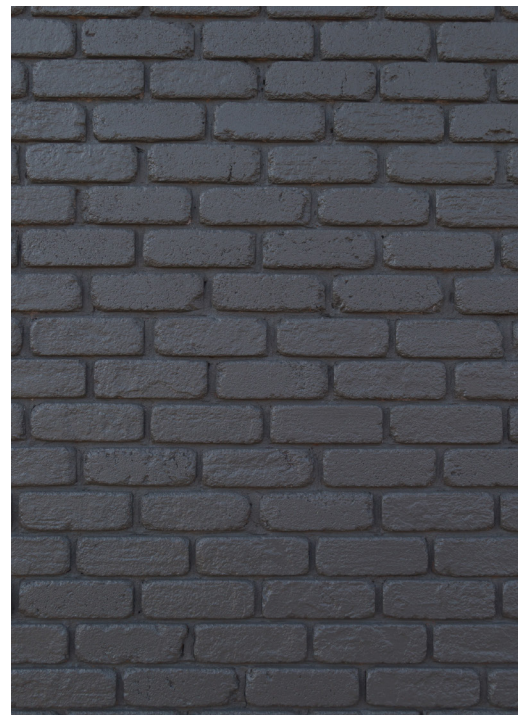
Photo 5 Mineral Paint Finish on Brickwork with Raked Joints

Similar to limewash, the water vapor permeability of the substrate is not affected when mineral paints are applied. The paints are UV-resistant, contain zero VOCs and due to their high pH resist biological growth. These paints, though similar in appearance to the matte and opaque applications of limewash, differ in their durability and length of service. Because of these factors, mineral paints typically have warranties of 15 years or more, and there have been projects in which recoating was not required for 30 years or more.