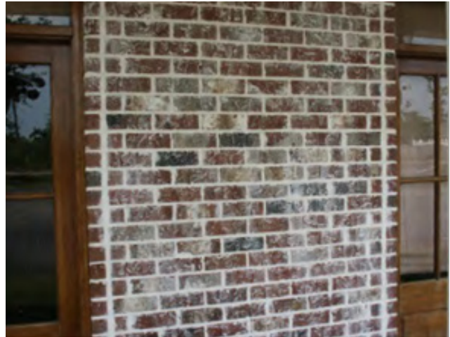
Photo 7 Semi-Opaque Application of Mortar Wash