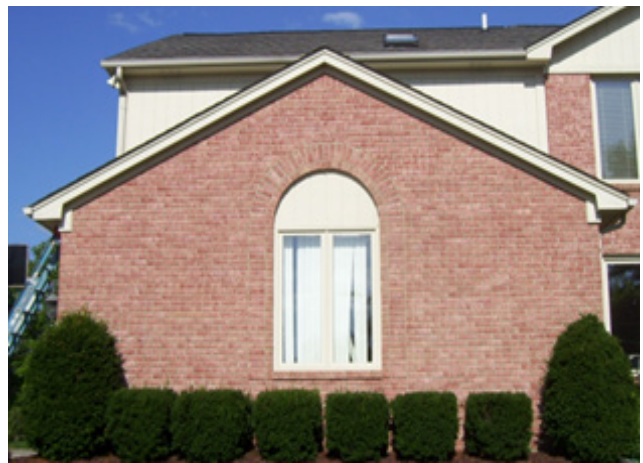
Photo 2 After Staining Applied