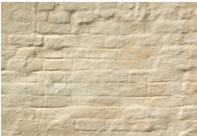
Photo 3 Opaque Finish of Limewash

Limewash, sometimes referred to historically as “whitewash,” is a centuries-old method of protecting buildings and modifying their appearance. In the United States, it was used on many historical buildings, often in cellars or outbuildings, and was recommended for use on the exterior of lighthouses during the early 1900s [Ref. 5]. It