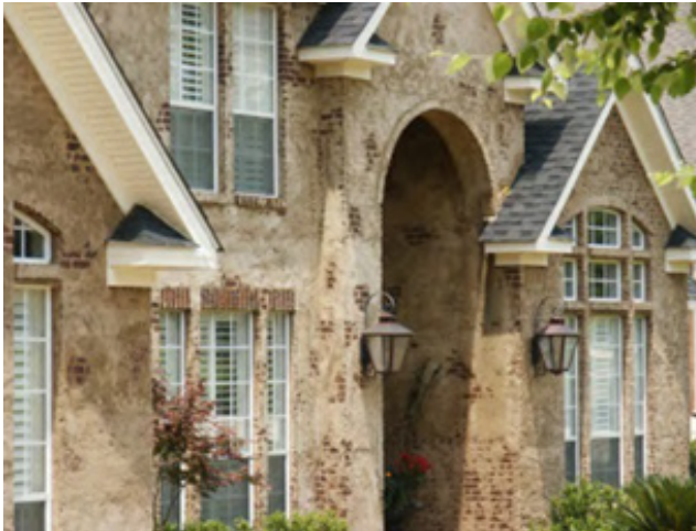
Photo 6 Mortar Wash Obscuring Areas of Brick

When applying mortar wash, it is recommended to use pre-bagged, pre-blended mortar conforming to ASTM C1714 and C270 [Ref. 1] for best results. Pre-bagged, pre-blended mortar includes all necessary material components, so only the addition of water is needed. Typically, Type N mortar should be used, but Type S mortar can be used as well. Standard colors for mortar include gray and white; however, colored mortars are available if desired. Mortar itself solidifies through a chemical reaction, making it a durable treatment. Binding with brick through fines entering into the pore structure of the brick, mortar wash creates a durable bond that can last for many years.